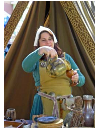
The Ravens Viking Encampment