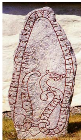
Runestone from Uppland