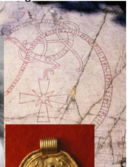
Viking Age Design