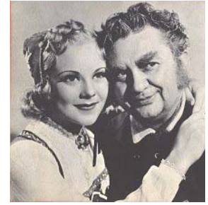
Jean Hersholt as the father of Sonja Henie in the 1937 film "Happy Landing"

kind, gentle and wise country doctor who presides over his small town community of the late 1930's and helps them to resolve all the woes and adventures of life. In those days, the power of early Sunday afternoon radio was so great and his character was so convincing that letters asking for medical advice weren't uncommon. In 1939 he began filming a series of six Dr. Christian movies♦.