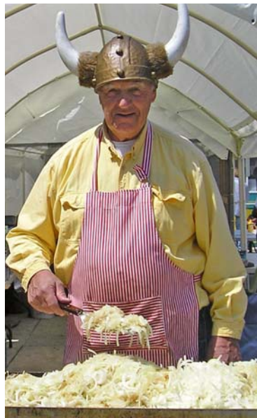
"Viking Dogs" and Æbleskivers are just two of the tasty food items available in the Scandinavian Festival Food Court