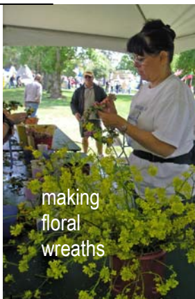
making floral wreaths