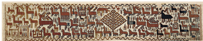
Lena Norrman led a visual guided tour of the Överhogdal tapestry dated 1,000 AD